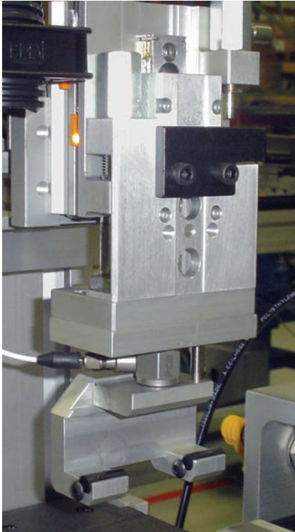
Assembly force monitoring using 208C Series force sensor

Quartz, piezoelectric force sensors are durable measurement devices with exceptional characteristics for the measuring of dynamic force events. Typical measurements include dynamic and quasistatic forces as encountered during actuation, compression, impact, impulse, reaction, and tension.